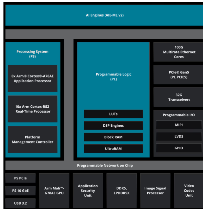
VERSAL Prime & AI Edge Series Gen2 Block Diagram